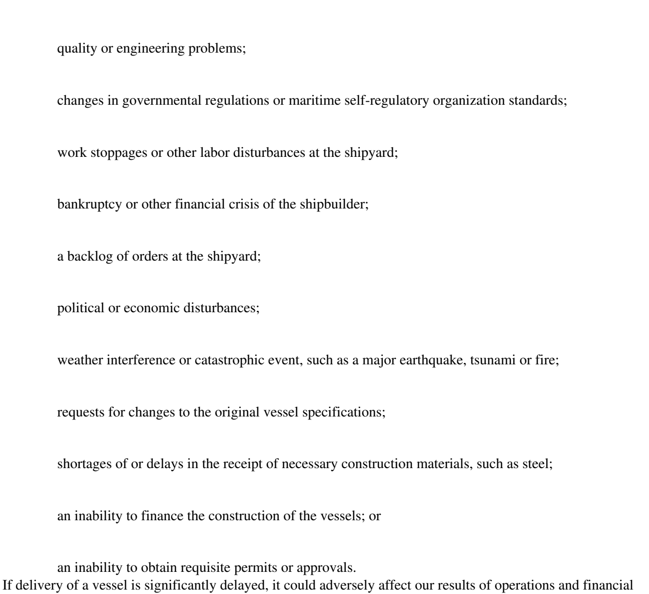
Table of Contents 26

The delivery of any newbuilding that we may order could be delayed, which would delay our receipt of revenues related to the vessel. The completion and delivery of newbuildings could be delayed because of: